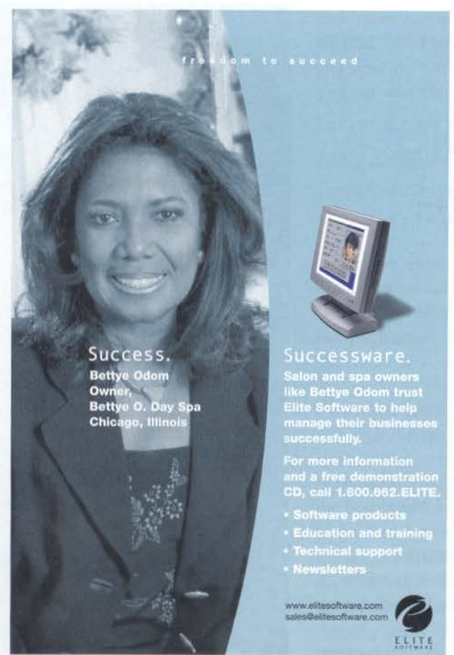
Reader Service No. 169